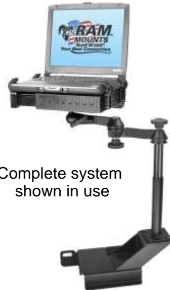
Complete system shown in use

National Products, Inc. Phone: 206-763-8361 Fax: 206-763-9615 Address: 8410 Dallas Ave S Seattle, WA 98108 Website: www.ram-mount.com Email: staff@ram-mount.com